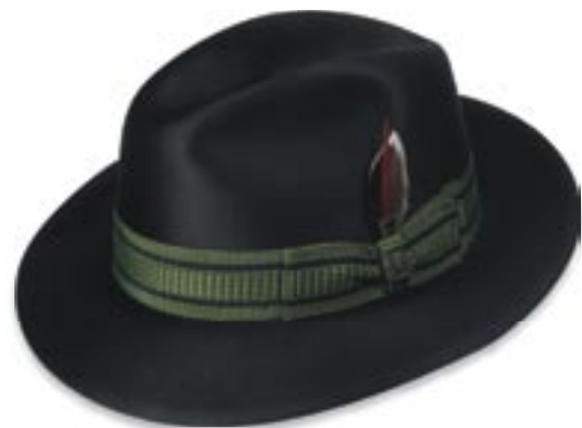
DF1039 DESIGNER SERIES Black Brim 2 1/4"