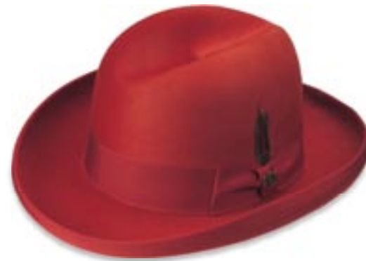
DF4606 HOMBURG SOLEIL Red Brim 3"