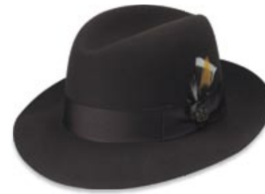
DF1314 ROYAL BILTMORE Black Oak Brim 2 3/8"