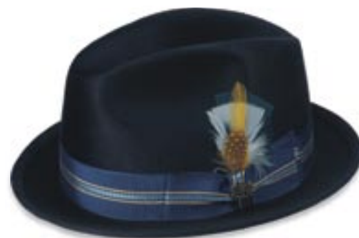
DF0842 ELEGANZA Navy Brim 1 1/2"