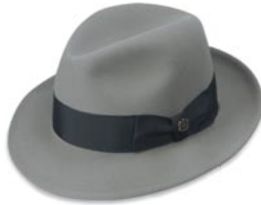
DF0338 ROYAL BILTMORE Banker Grey Brim 2 1/4"