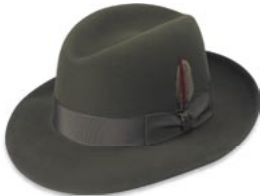
DF5023 CANADIAN SUEDE Sage Brim 2 1/2"