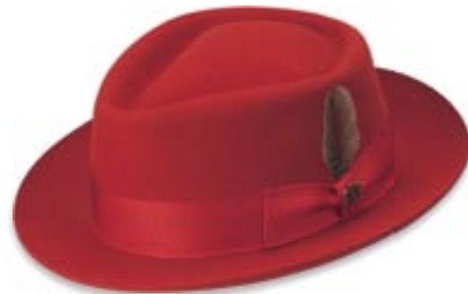
DF1184 DESIGNER SERIES Red Brim 2"