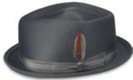
DF2184 ELEGANZA Steel Brim 1 1/2"