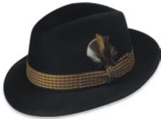
DF0746 GOLDEN PHEASANT Black Brim 2 1/4"