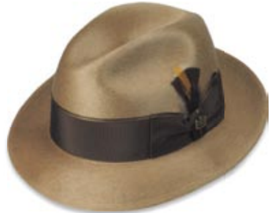
DF0949 PELUCHE Camel Brim 2"