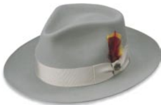
DF1035 DESIGNER SERIES Willow Brim 2 3/4"