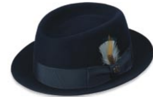
DF1395 ROYAL BILTMORE Navy Brim 1 7/8"