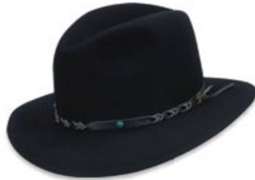
DF1042 DESIGNER SERIES Black Brim 2 3/8" X 2 3/4"