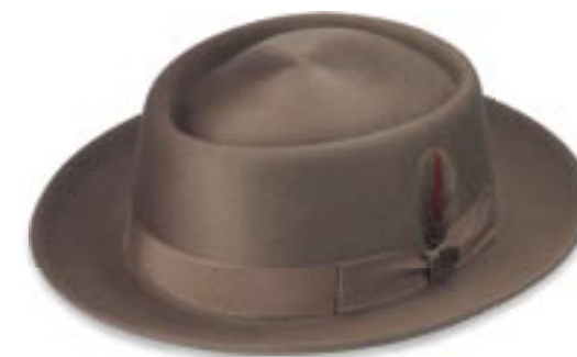
DF2158 ELEGANZA Limestone Brim 2"