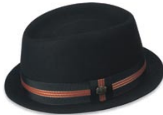
WD0050 DRESS WOOL Black Brim 1 1/8"